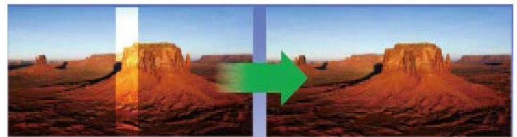
Edge-blending (requires 2pcs. of iEB789)