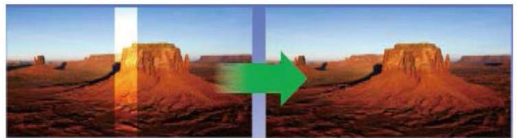
Edge-blending (requires 2pcs. of iEB790)